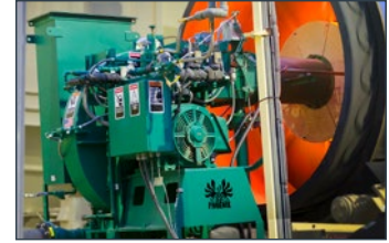
The simple and accessible construction makes burner maintenance easy; while its rugged build keeps maintenance costs to a minimum.

Each burner is thoroughly tested before leaving the Astec burner facility to make start-up at your facility as fast as possible. For the most reliable oil light-off, even under cold and harsh conditions, the Fury burner is supplied with Astec's exclusive heat tracing and insulation system on heavy oil burners.