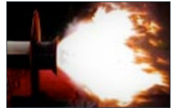
The compact flame enables the Fury burner to work with virtually all drum designs.